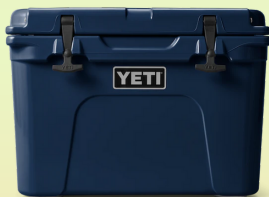
YETI Tundra 35" Cooler