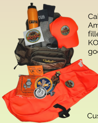
Cabelas Ammo Bag filled with KOSC goodies